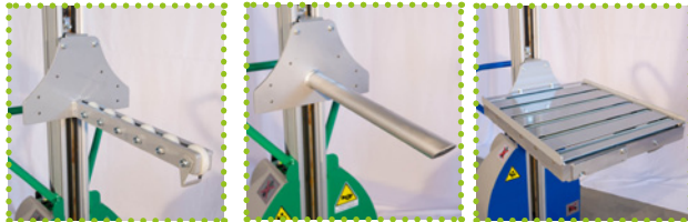
SR - Spur with rollers