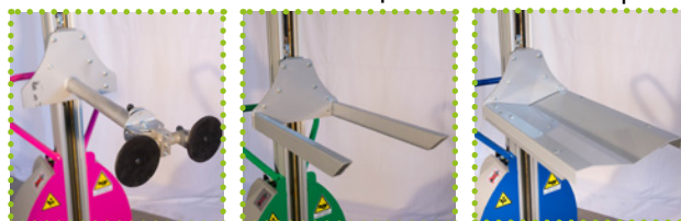
PV - Glass Holder