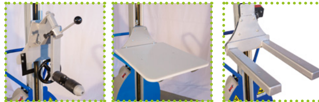
R - Roto-reel