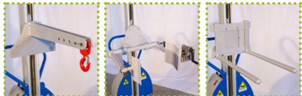
G - Crane Arm