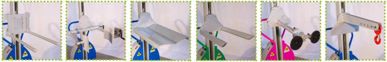
DS - Double Spur